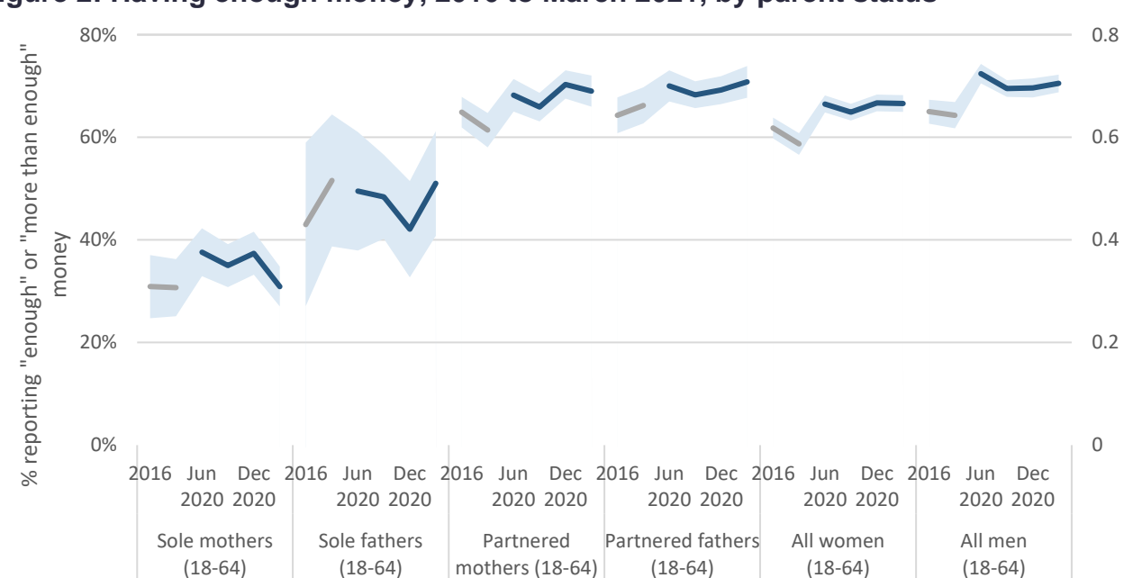
Figure 2: Having enough money, 2016 to March 2021, by parent status

For some groups and outcomes, there was little initial improvement in June 2020, and then a subsequent decline.